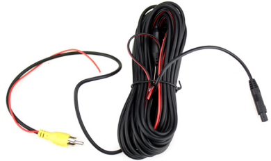
8m extension cable